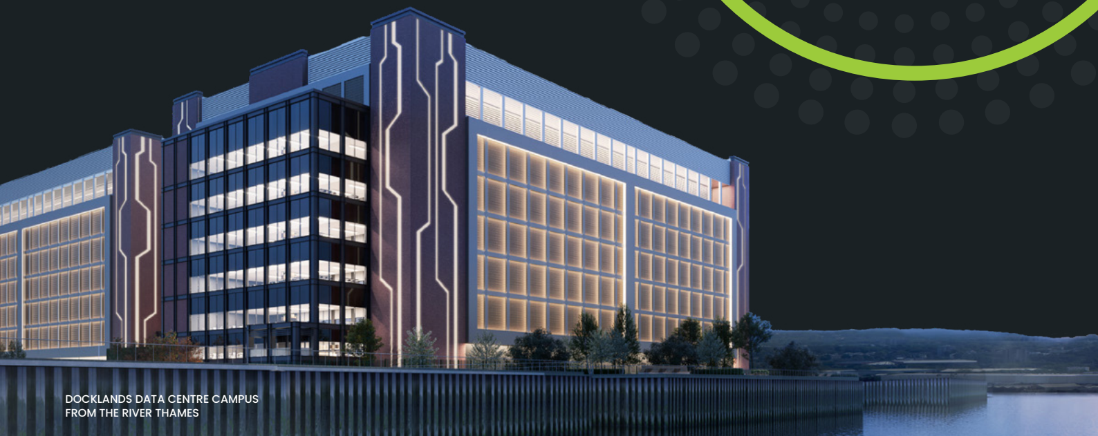
DOCKLANDS DATA CENTRE CAMPUS FROM THE RIVER THAMES